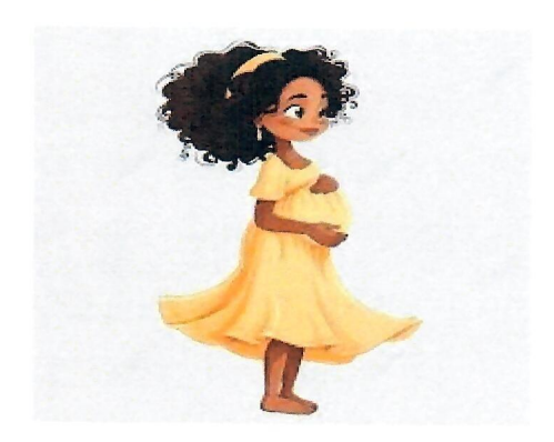
Happy Mother's Day Sunday May 12, 2024

THE MORAL: A mother's love and upbringing can help change the destiny of a child.